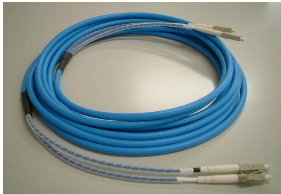
LC Connector × 2 Cores PC Polished